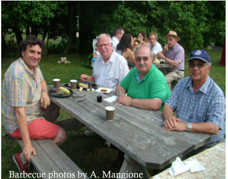
Barbecue