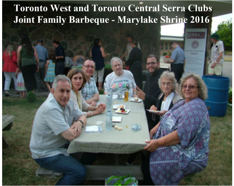
Toronto West and Toronto Central Serra Clubs Joint Family Barbeque - Marylake Shrine 2016