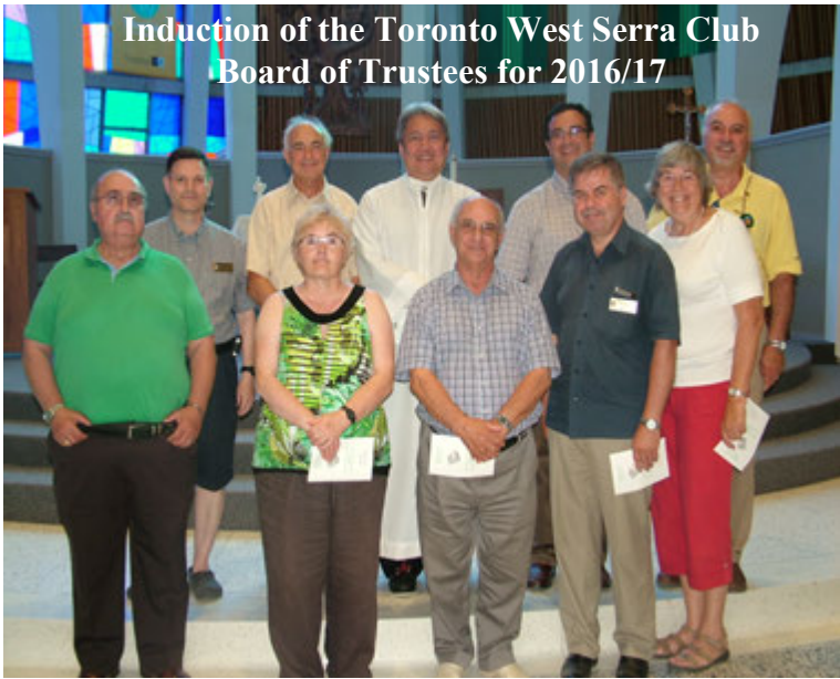
Induction of the Toronto West Serra Club Board of Trustees for 2016/17