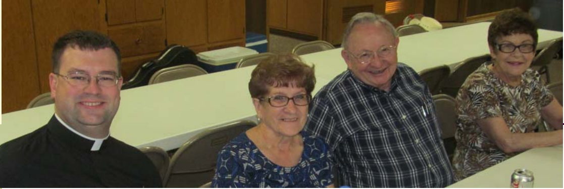
Serra Clubs of Eastern South Dakota Newsletter for its Members Third Quarter 2016