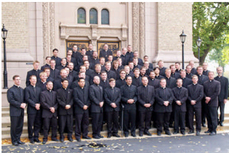
Seminarians of the Archdiocese of Denver

Saturday, December 5: Regular Club meeting and Mass and Breakfast, Emmitsburg Room SEAS