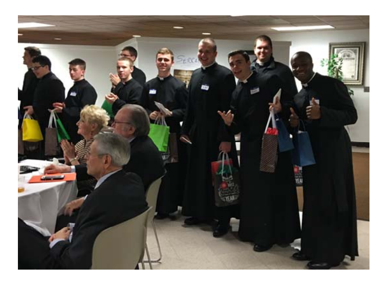
Our Seminarians Receiving their Christmas Gifts