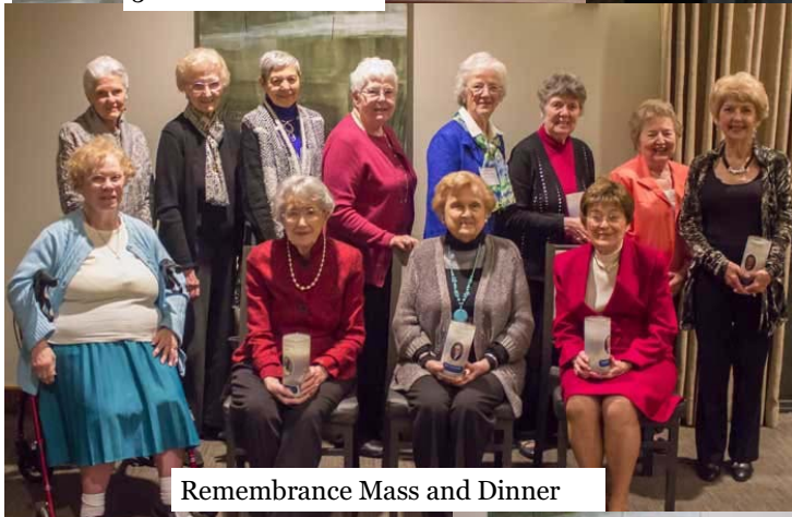
Remembrance Mass and Dinner