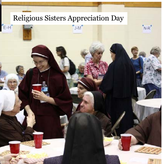
Religious Sisters Appreciation Day