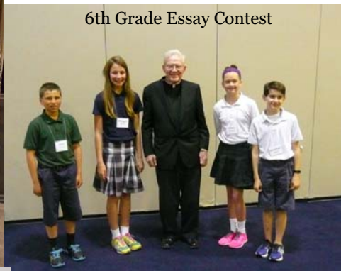
6th Grade Essay Contest