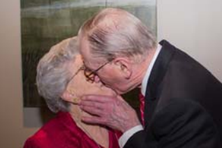
Valentines Day Mass and Dinner (Left)