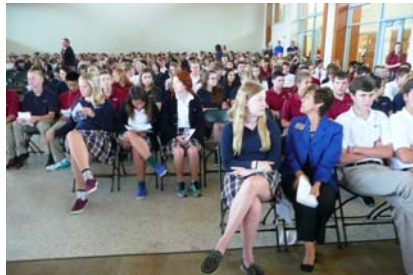
(Upper Left)—Retreat at Savior Pastoral Center (Above) Ordination at Saint Michael the Archangel