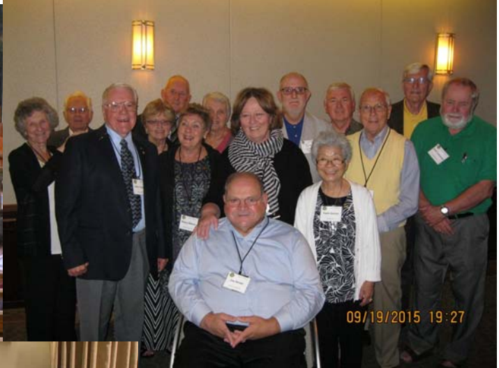
Des Moines Conference (Top)