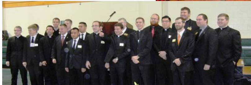
Group Photo of Seminarians attending