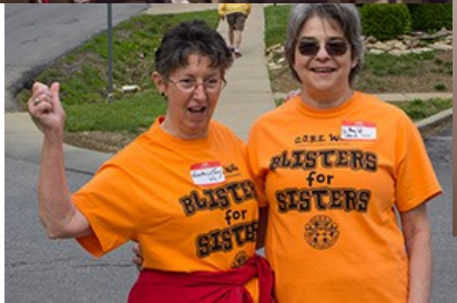
Blisters for Sisters