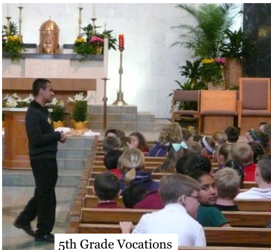
5th Grade Vocations