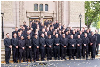
Seminarians of the Archdiocese of Denver

October 5: Serra Social – Harmony Grill 6:30 p.m.