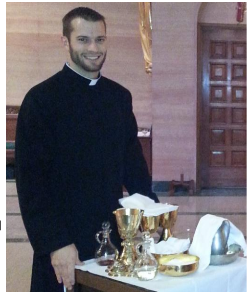
Serving as an Acolyte at mass

This summer I served as a chaplain at Methodist Hospital. I completed one unit in the CPE Program and gained experience in pastoral ministry.