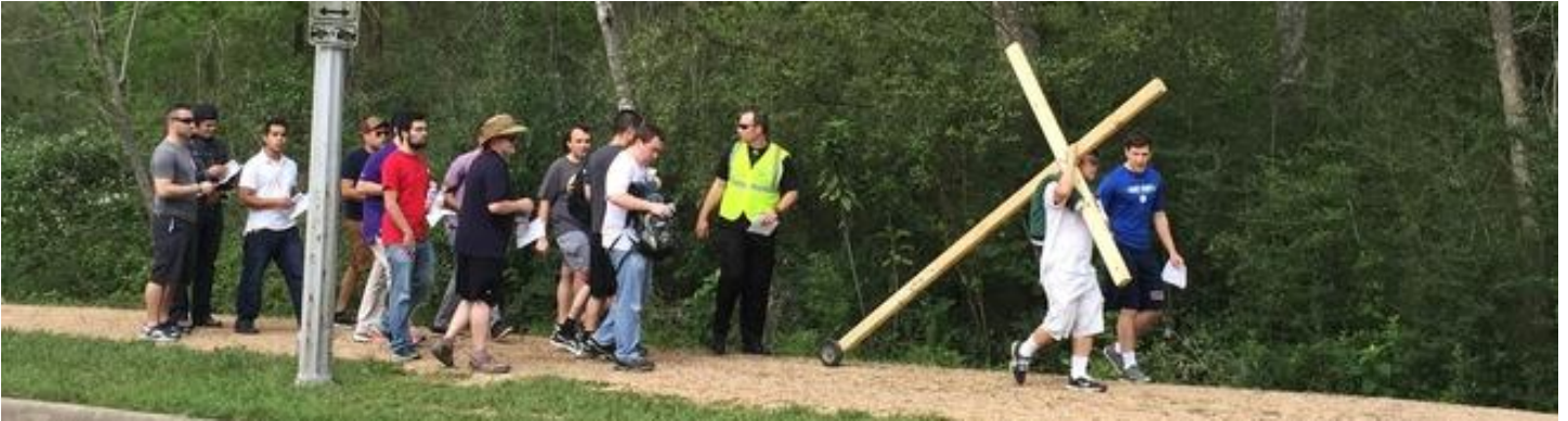
Lenten Procession to the Co-Cathedral